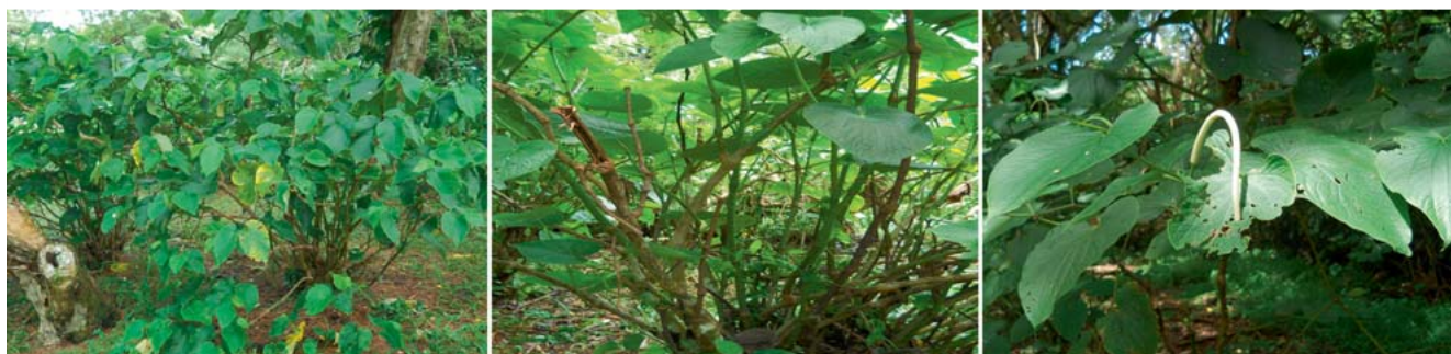
Fig. 3 Typical morphology of kava cultivars found on the island of Santo, Vanuatu. (Color figure available online only.)

sible hepatotoxicity of kava preparations was potentially caused by ill-defined herbal drug identity, a lack of appropriate quality control, and misguided regulatory politics.